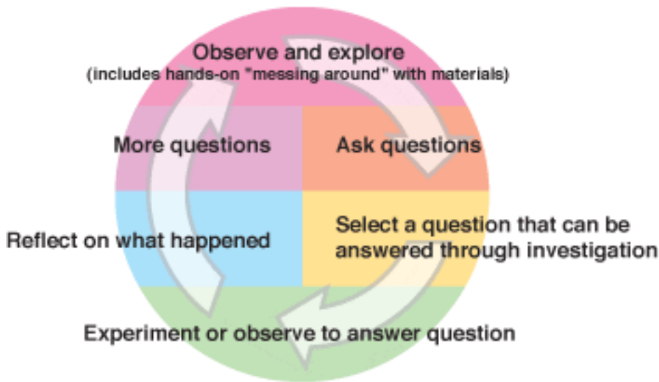
Figure 1. The inquiry process

Productive, inquiry-based science study enables children to realize they can raise and answer questions themselves. The scientific method is the inquiry process by which scientists raise and attempt to answer new questions.